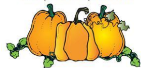
Storybook Pumpkin Patch

You are invited to come see the pumpkins during our book fair, October 15-18! Thank you for helping your student with this fun family project!